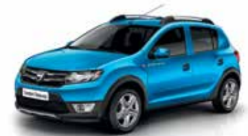
Azure Blue (RPL)