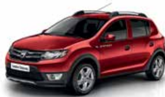
Fire Red (B76)