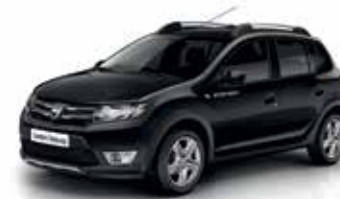
Pearl Black (676)