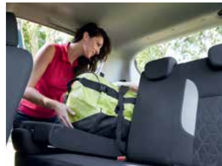
60/40 split folding rear seats