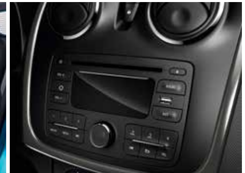
Radio, CD, MP3 with Bluetooth connectivity