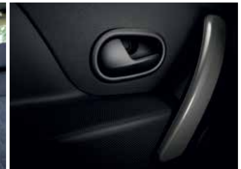
Graphite front door handles - Signature only