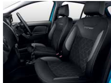
Dark carbon 'Stepway' cloth upholstery