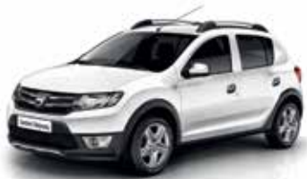
Glacier White (369)