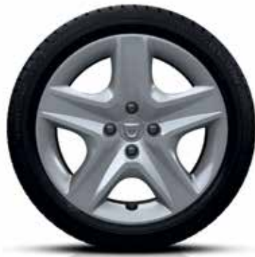
16" 'Stepway' design wheels